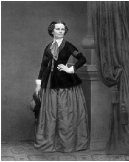
Hosmer 1857 portrait of Harriet Hosmer by Matthew Brady

“Who gets written into history? Who is forgotten? Why, how and what are the conditions in which eradication can occur? How is value determined? These elements coalesce at the intersection of the ivory tower and the art market that is the catalogue raisonné.”