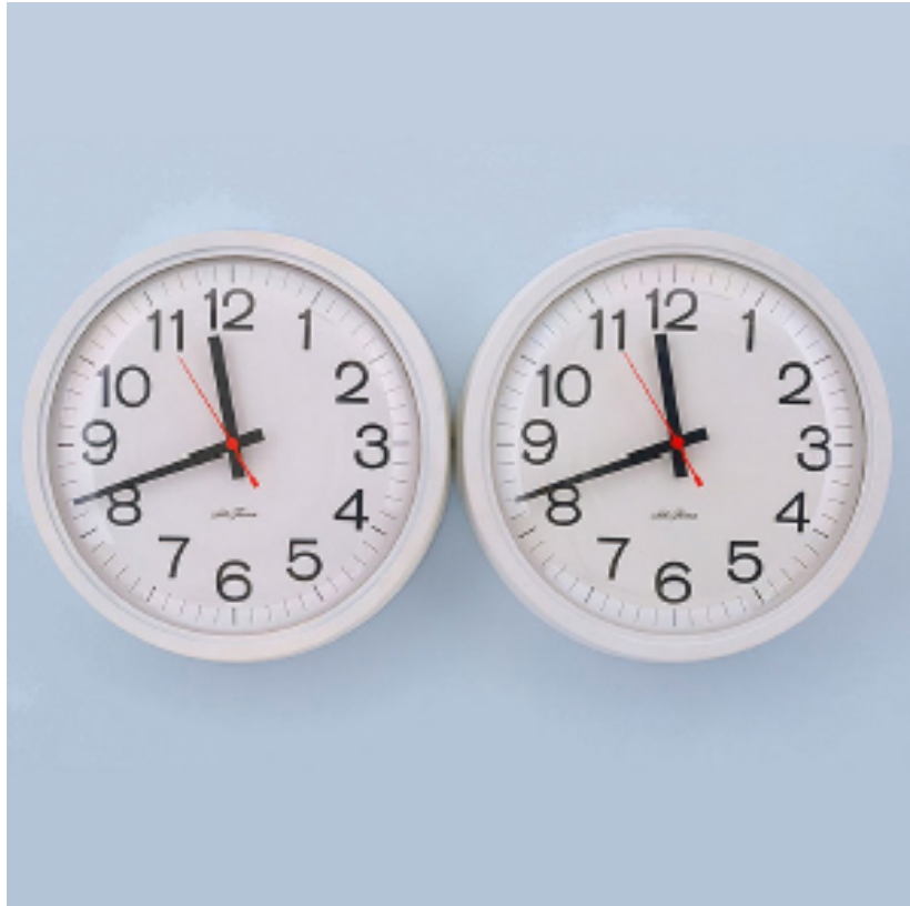
Felix Gonzalez-Torres, "Untitled" (Perfect Lovers), 1991 Clocks, paint on wall, 35.6 x 71.2 x 7 cm, The Museum of Modern Art, New York