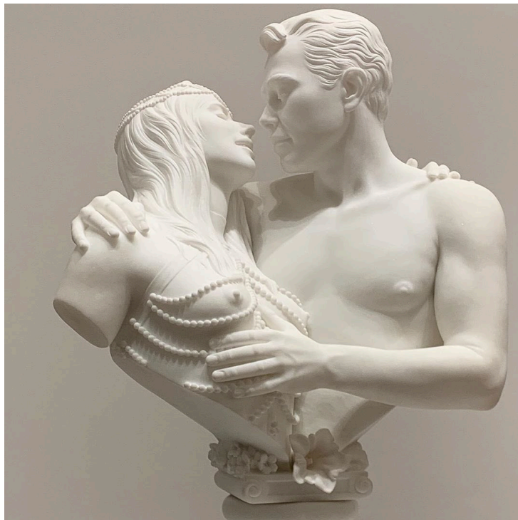
Jeff Koons, “Bourgeois Bust,” 1991, Marble, 119 x 74.55 x 58 cm Tate, London