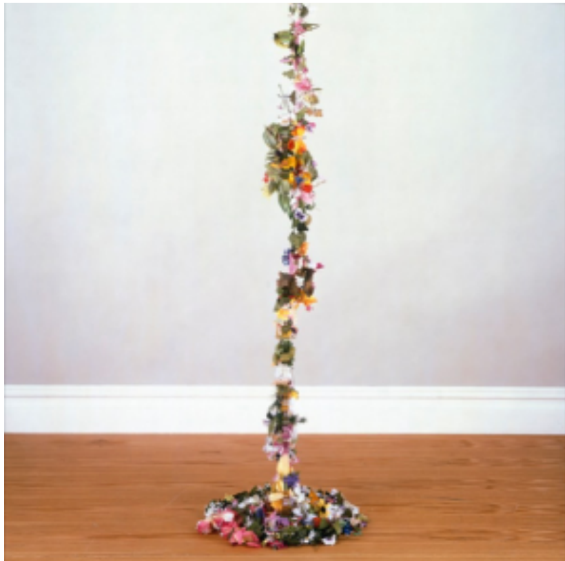
Jim Hodges, "A Line to You," 1994, Silk, plastic, and wire with thread 535.9 cm, Private Collection