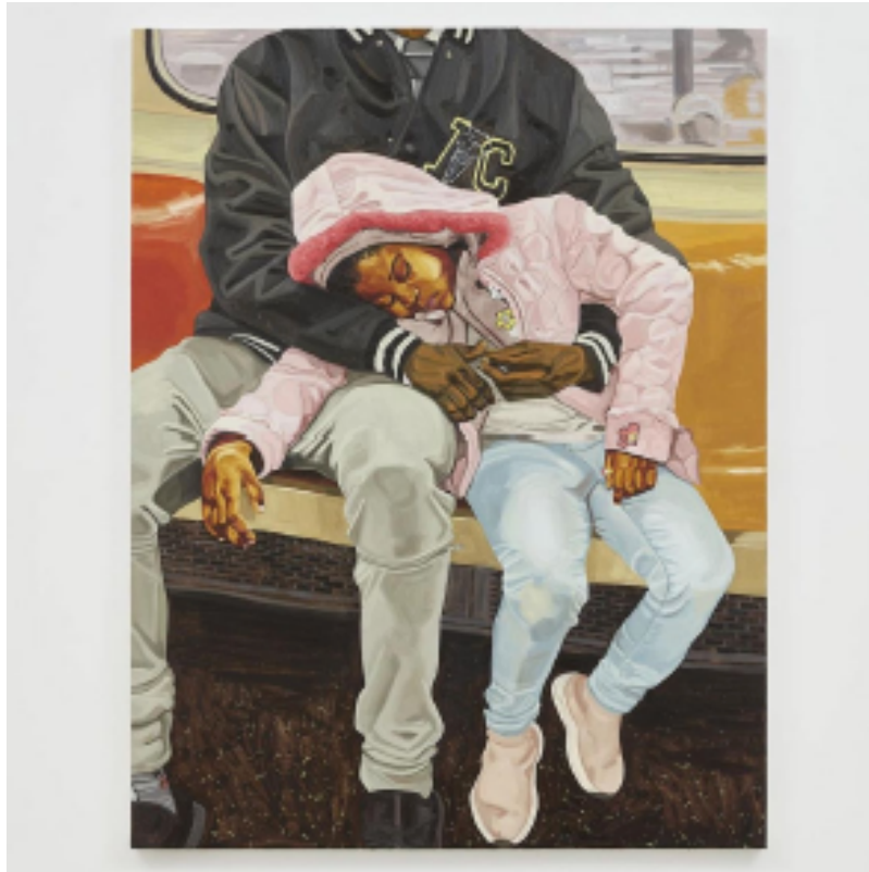
Jordan Casteel, "Golden Girl," 2019, Oil on canvas, 180.3 x 142.2 cm, Private Collection

Find this article at: https://www.instagram.com/p/B-7e9wjAE9G/