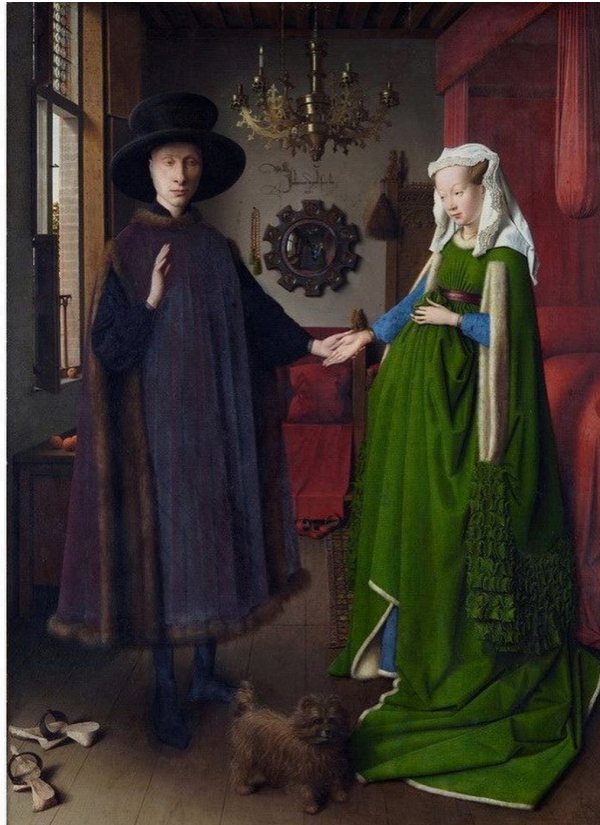
Jan van Eyck, "Portrait of Giovanni(?) Arnolfini and his Wife," 1434 Oil on oak, 82.2 x 60 cm, The National Gallery, London