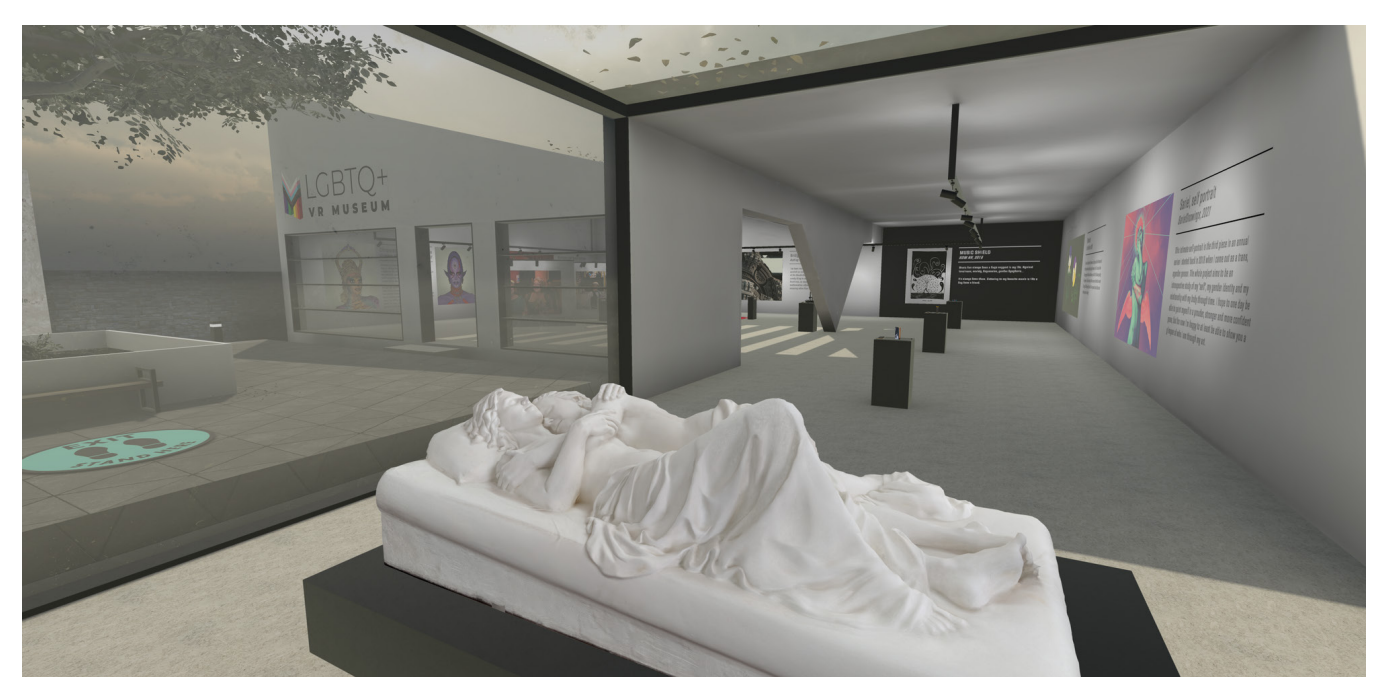
The marble statue 'Memorial of a marriage' is one of the main attractions at the LGBTQ + VR Museum.

Therefore, at the VR Museum you can stand with a pair of shoes that a woman got married in, see a book that a man used to tell his parents that he was gay, or get really close to the museum's main attraction - a marble statue of two women sleeping while holding each other.