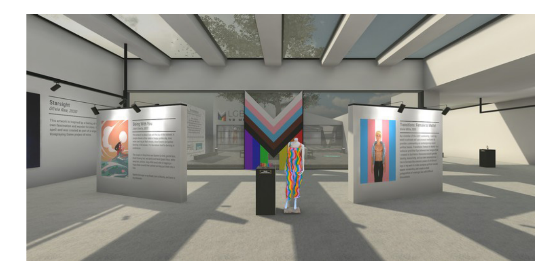
THE INTERIOR OF THE LGBQ+ VR MUSEUM.

Stepping inside the museum, the experience of entering an alternate reality transcends the technical beauty of its pristine surfaces and colourful exhibits. It's my first time using a Meta Quest 2 headset, and its immersive quality is certainly sufficient to convince me I'm about to fall off the step to the garden outside on more than one occasion. But what's truly remarkable is the sense of occupying a queer space which isn't a temporary loan, when LGBTQ+ events are so often stuffed into straight-leaning dive bars, standard art venues, or otherwise makeshift DIY affairs. It's a dedicated space, and one that you realise the UK is severely lacking after the headset comes off.