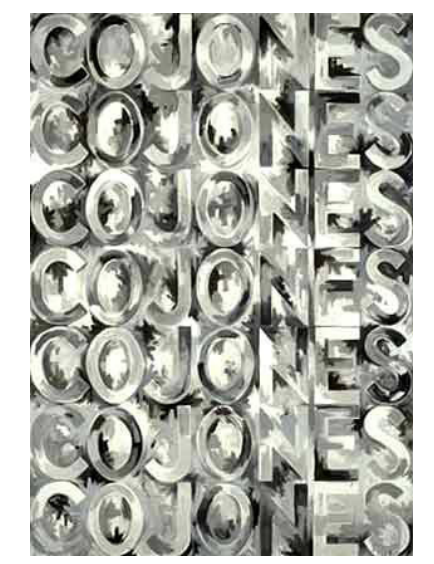
Deborah Kass Painting with Balls 2003