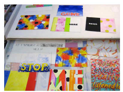
A flatfile of Deborah Kass studies