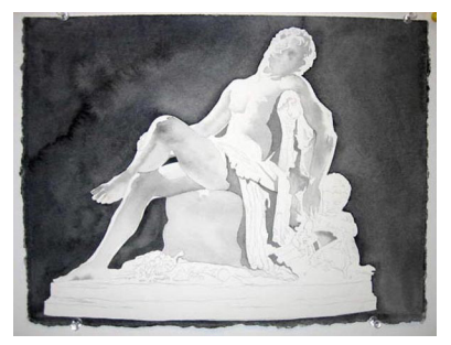
Patricia Cronin's Sleeping Faun watercolor, in progress