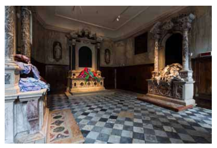
installation view at the historic sixteenth-century chiesa di san gallo