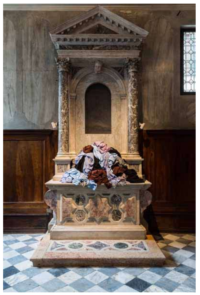
a pile of hijabs on the altar reflects on the recent kidnapping