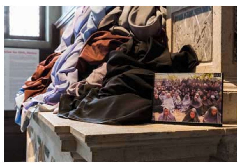
an altar exhibits hijabs symbolizing the 276 schoolgirls kidnapped by boko haram in nigeria