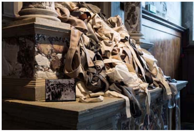
the third altar presents a heap of uniforms representing those worn by girls at the magdalene asylums