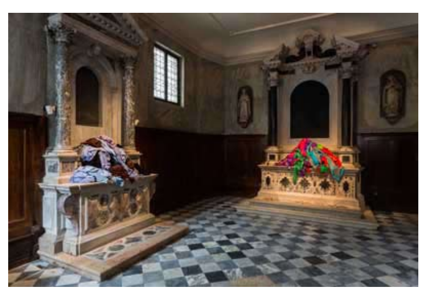
three altars display stacks of clothing representing girls around the world who face repression

for 'shrine for girls' presented for the venice art biennale 2015, the new york-based conceptual artist has arranged hundreds of girls' clothes on three stone altars, reflecting on the incalculable loss of young martyrs.