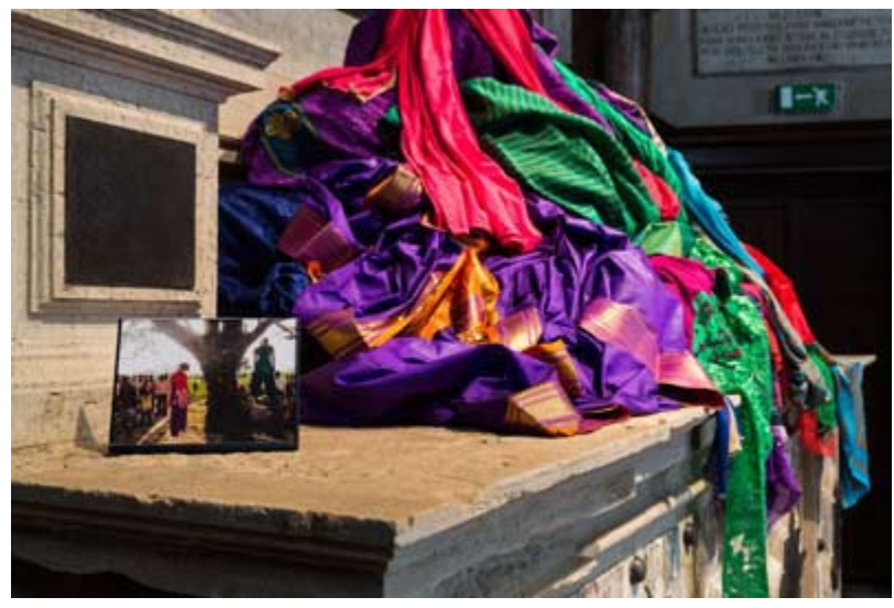
the installation is in remembrance of three women who were recently gang raped, murdered and left to hang from trees