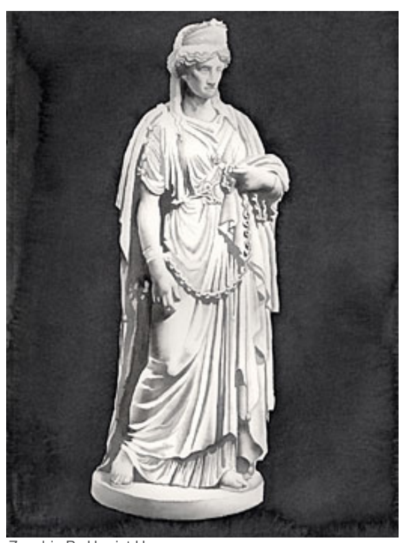
Zenobia By Harriet Hosmer, The Harriet Hosmer Catalogue Raisonne Project