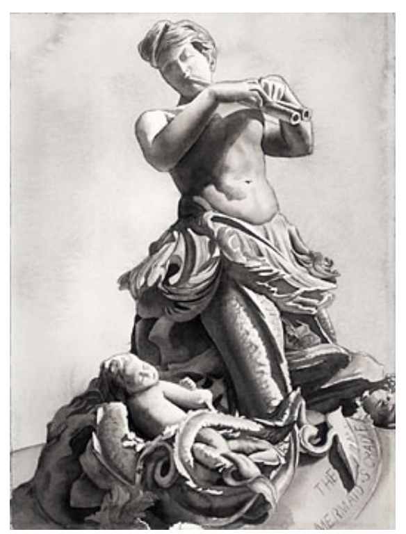
Mermaid's Cradle By Harriet Hosmer, The Harriet Hosmer Catalogue Raisonne Project