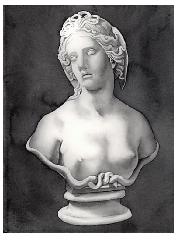
Medusa By Harriet Hosmer, The Harriet Hosmer Catalogue Raisonne Project