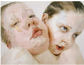
Jenny Saville Hyphen , 1999 private collection