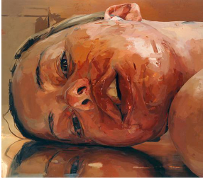
Jenny Saville Reverse , 2002 "Jenny Saville" Norton Museum of Art