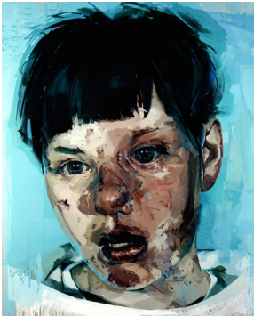
Jenny Saville Stare 2004-05