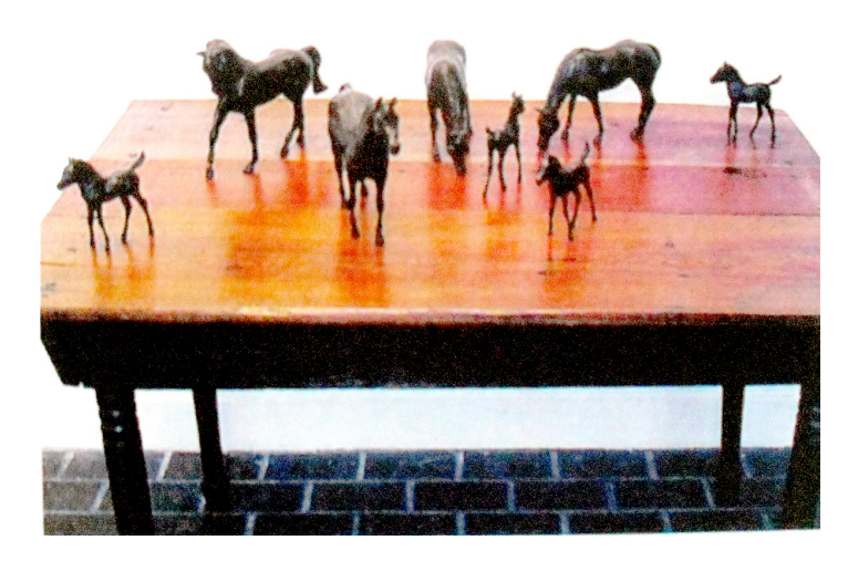
The Domain of Perfect Affection, 1999. Wax and pine table, 40 \times 48 \times 30 in.

PC: The learning curve is high. A very good carver from Russia taught me as we went along. Each carver has his or her own specialty: roughing out, undercutting, decorative details, or polishing. I got a fast education.